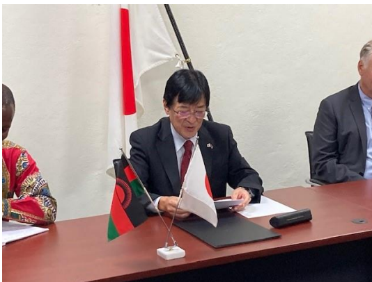
Ambassador giving a speech