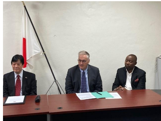
JTI Managing Director giving a speech