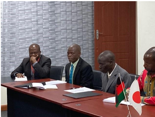
Head Teacher giving a speech