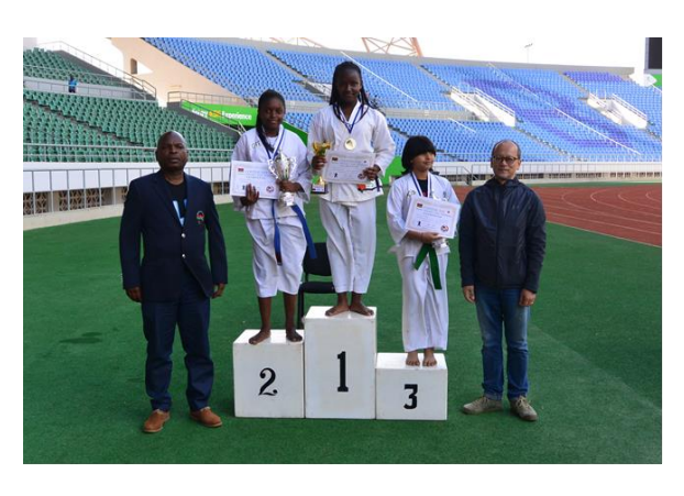
A commendation ceremony (children category)