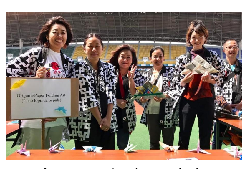
Japanese community at the origami booth