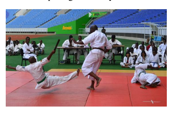
Ju-jitsu performance by Proteligent