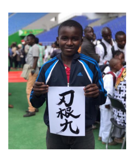
A boy holding a paper Where his name is written in Japanese