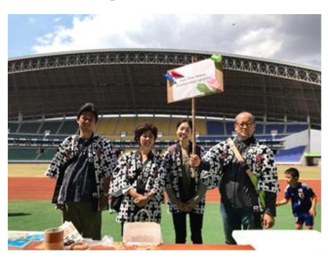
Japanese Community at the kami-hikoki booth