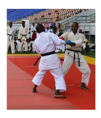
Demonstration of Kumite