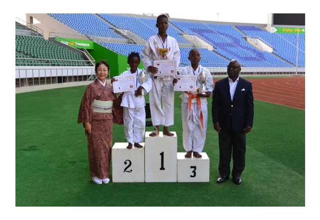
A commendation ceremony (children category)